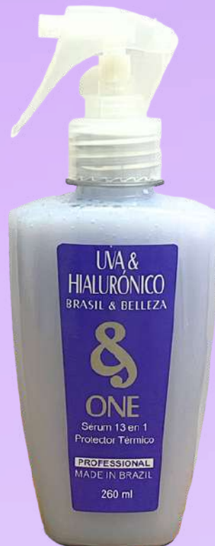
BB One 200ml